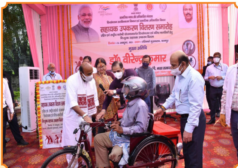
Distribution camp conducted on 31.10.2021 in the presence of Hon'ble Union Minister of Social Justice and Empowerment at ALIMCO Headquarter, Kanpur.