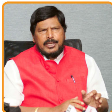
Shri Ramdas Athawale Minister of State of Social Justice & Empowerment