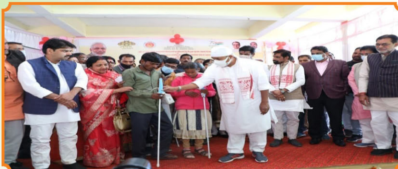
Distribution camp conducted on 14.02.2022 in the presence of Hon'ble Union Minister of Social Justice and Empowerment at ALIMCO Tikamgarh, Madhya Pradesh.