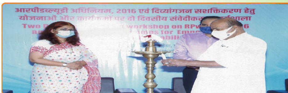
Two day workshop on RPWD Act 2016

Schemes Implemented by the Department of Empowerment of Persons with Disabilities (Divyangjan)