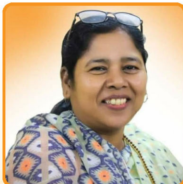
Km. Pratima Bhournik Minister of State of Social Justice & Empowerment