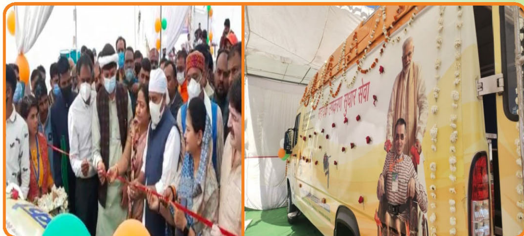
Distribution of assistive devices and launch of 'An integrated Mobile Service Delivery Van' on 13.02.2022 at Chhatarpur, Madhya Pradesh