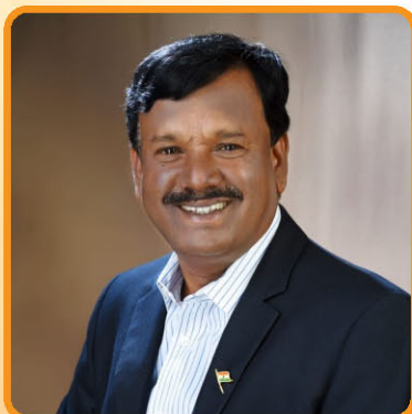
Shri A. Narayanaswamy Minister of State of Social Justice & Empowerment