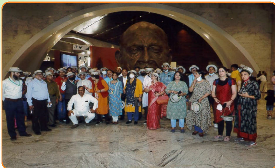
Ali Yavar Jung National Institute for Speech and Hearing Disabilities (AYJNISHD), Mumbai organized a sensitization workshop on 4th -5th March, 2022 at Tent City, Kevadia, Gujarat