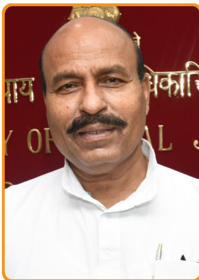
Dr. Virendra Kumar Union Minister of Social Justice and Empowerment