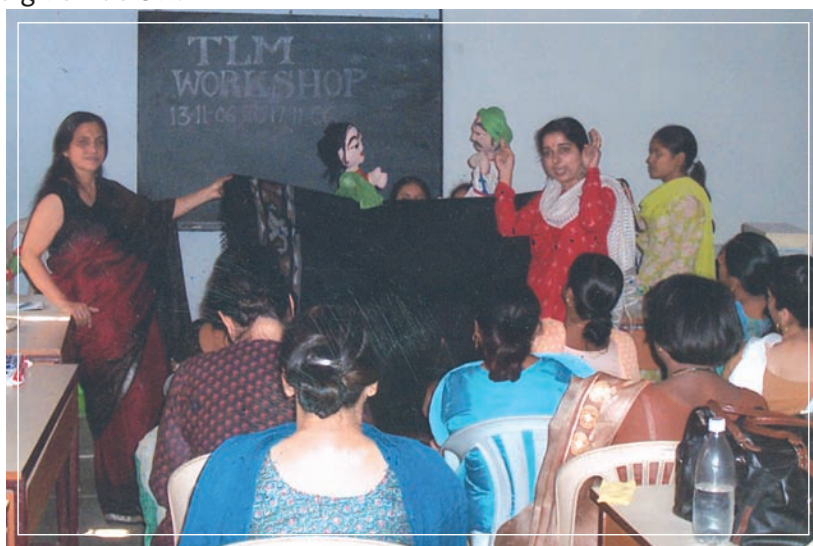
Details of certificate courses conducted during 2006-07

Feedback from the field indicated that there is a need for intensive training on therapeutics, assessment and transition to special teachers who are to handle the day - to - day training programmes for the children with mental retardation. This is in the direction of strengthening and making the special teachers and other professionals capable of delivering quality services. During 2006-07, five such programmes were conducted at NIMH, Secunderabad & RC, Delhi benefiting 57 professionals, the details of which are given below.